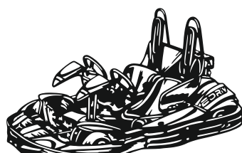
Karting biplace 440CB+2 71 x 48 cm +2 +3