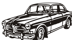
Volvo Amazone 562A+1 62 x 34 cm +1 +2 +3 +4