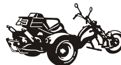
Trike 286 51 x 28 cm = +1 +2 +3 +4