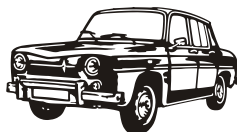
Renault R8 315 48 x 26 cm = +1 +2 +3 +4