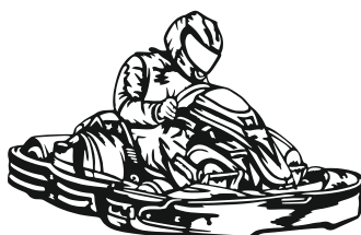
Karting 440CA+2 71 x 46 cm +2 +3