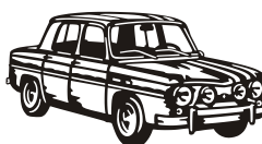
Renault R8 Gordini 315B 49 x 25 cm = +1 +2 +3 +4