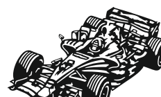
Formule 1 440 46 x 30 cm = +1 +2 +3 +4