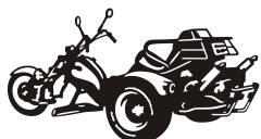
Trike 286B 51 x 28 cm = +1 +2 +3 +4