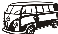
VW Combi 107B 43 x 25 cm = +1 +2 +3 +4