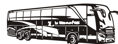
Autocar 517B+2 98 x 37 cm +2 +3 +4