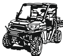
Mule Polaris Ranger 155B+3 86 x 76 cm +3 +4 +5