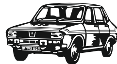
Renault R12 Gordini 377B 58 x 31 cm +1 +2 +3 +4