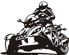
Spider 286C 40 x 32 cm = +1 +2 +3 +4