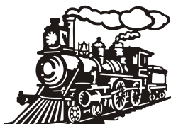
Locomotive à vapeur 280 40 x 31 cm = +1 +2 +3 +4