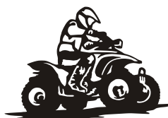
Quad 155 47 x 32 cm = +1 +2 +3 +4