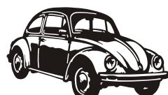
VW Coccinelle 107A 46 x 27 cm = +1 +2 +3 +4