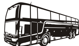
Autocar 517+1 58 x 36 cm +1 +2 +3 +4