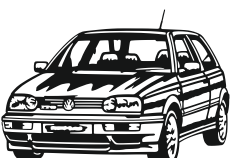
VW Golf GTI 3 107CB+1 52 x 36 cm +1 +2 +3 +4